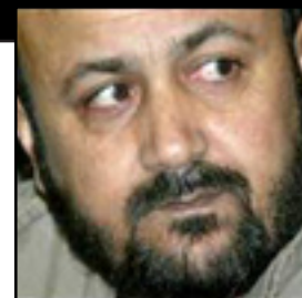
Al Aqsa Brigade